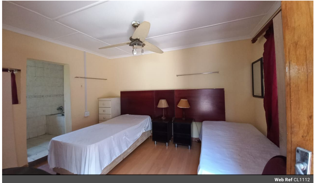
Web Ref CL1112

9a Park Road Umtata Central Mthatha 5100