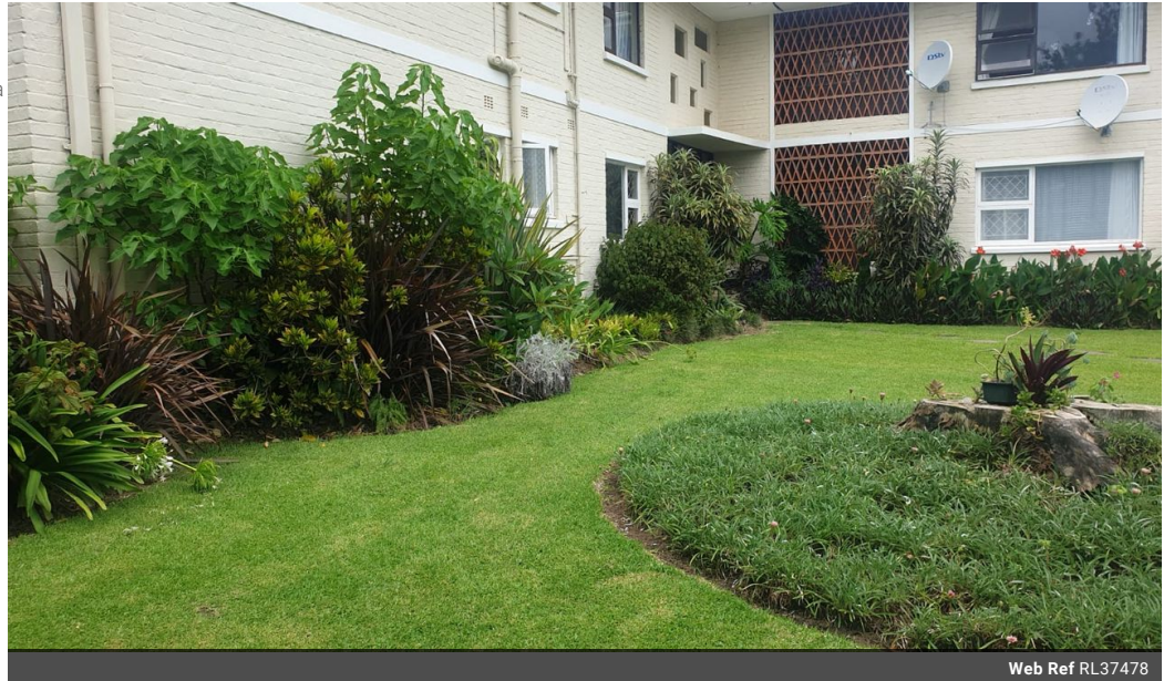
Web Ref RL37478

32 Bonza Bay Road Beacon Bay North East London 5205