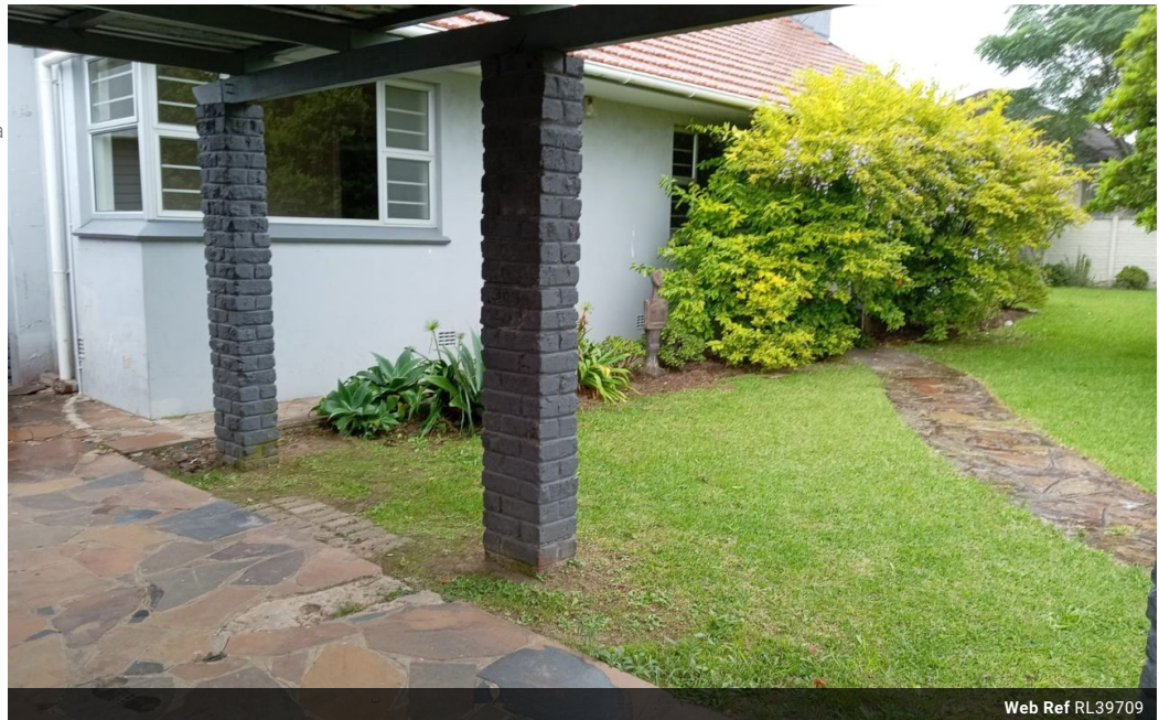
Web Ref RL39709

32 Bonza Bay Road Beacon Bay North East London 5205