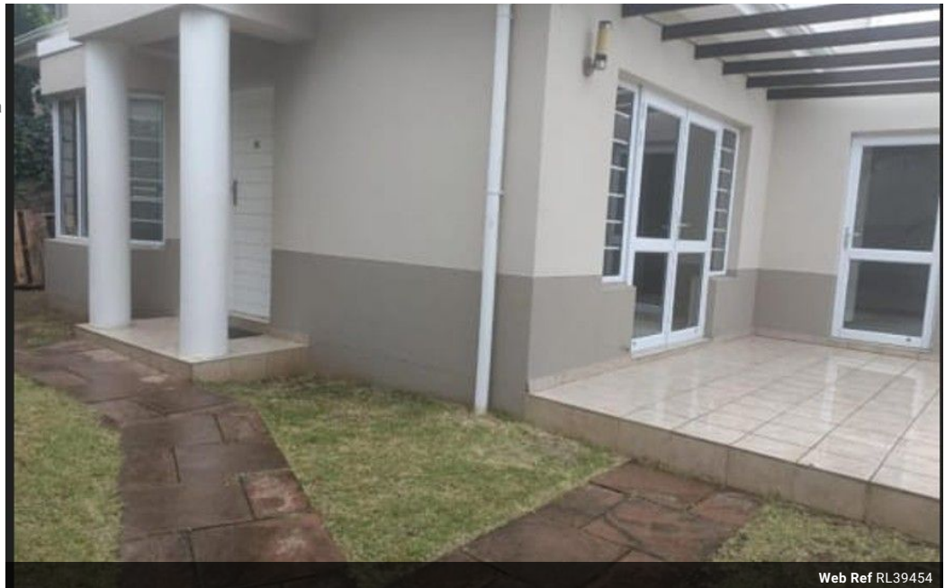
Web Ref RL39454

32 Bonza Bay Road Beacon Bay North East London 5205