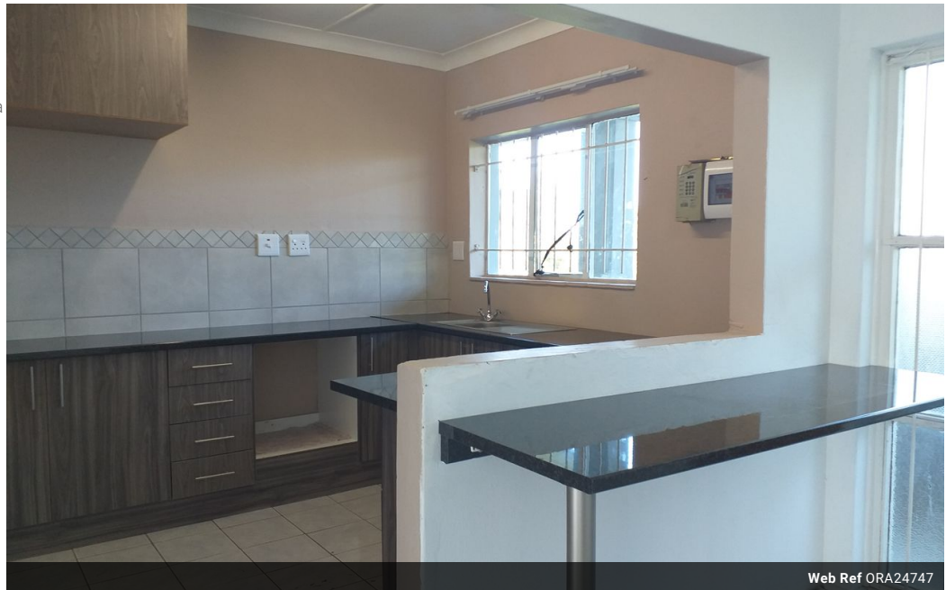
Web Ref ORA24747

32 Bonza Bay Road Beacon Bay North East London 5205