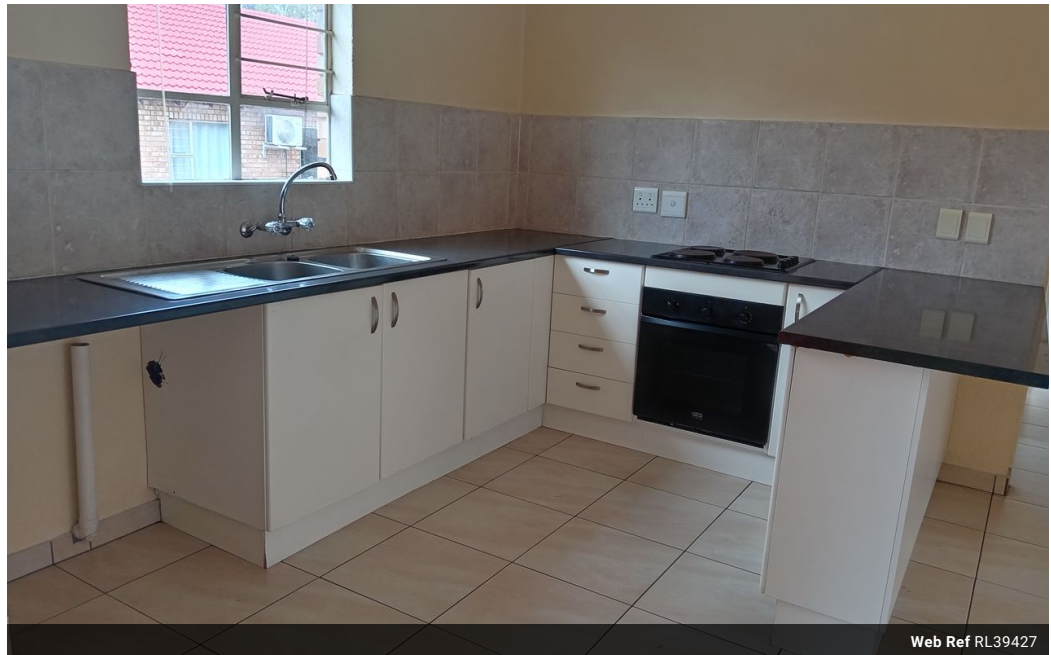
Web Ref RL39427

64 Michelle Avenue Randhart Alberton 1449