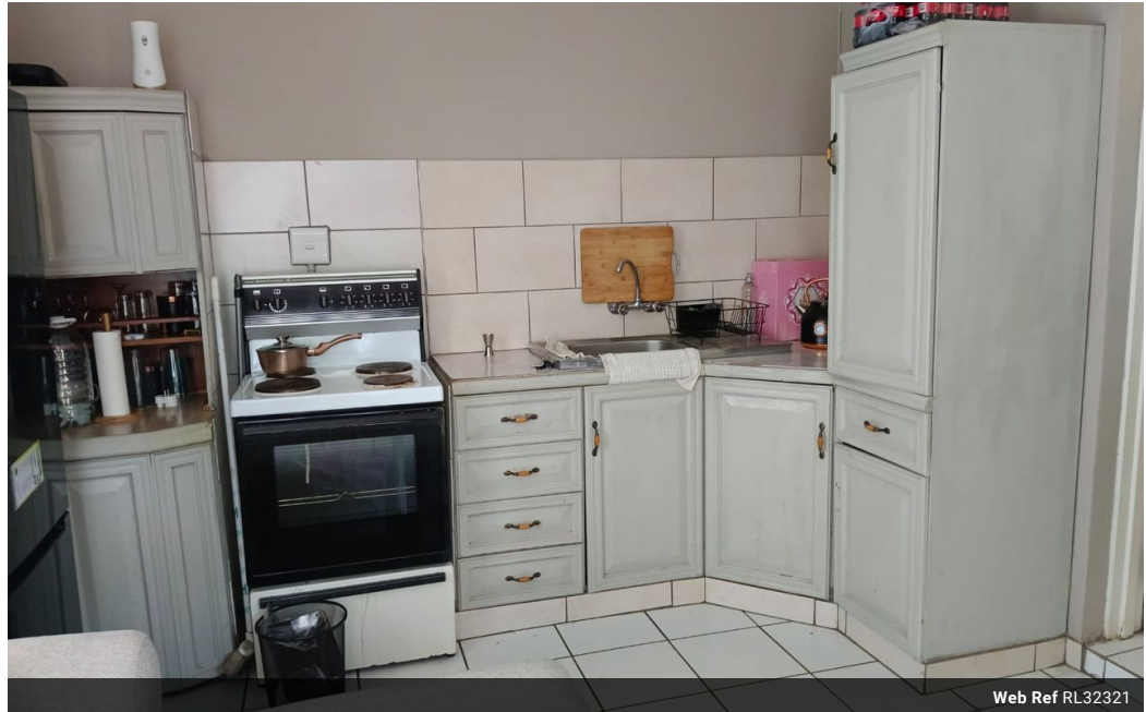
Web Ref RL32321

64 Michelle Avenue Randhart Alberton 1449