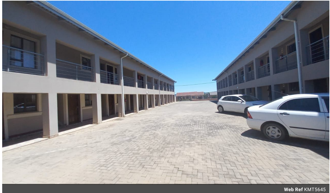
Web Ref KMT5645

9a Park Road Umtata Central Mthatha 5100