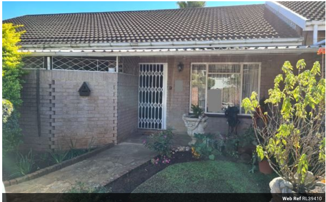
Web Ref RL39410