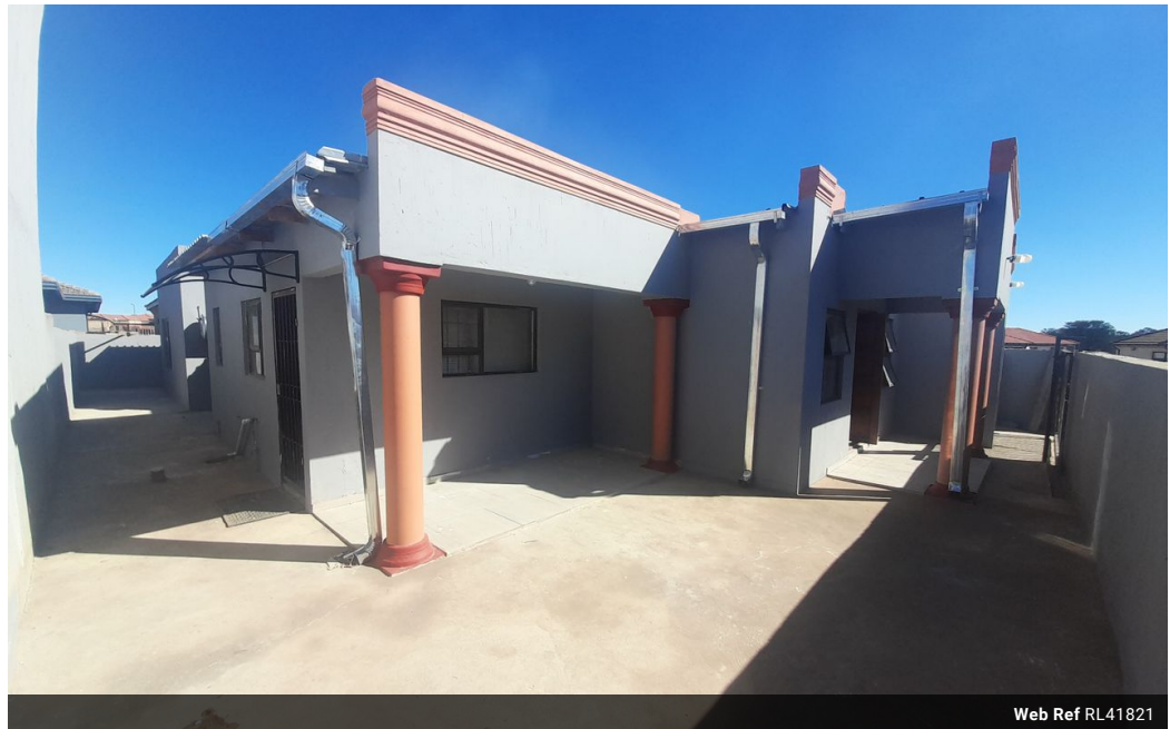
Web Ref RL41821

64 Michelle Avenue Randhart Alberton 1449