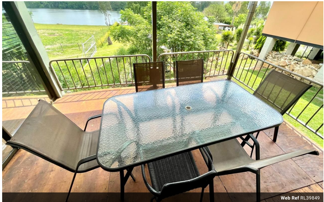
Web Ref RL39849

64 Michelle Avenue Randhart Alberton 1449